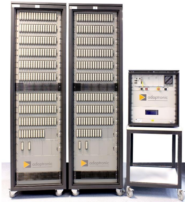
Test system NT 830 for the test bench EC 145 T2