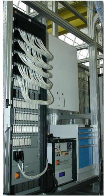
Integrated into the test bench